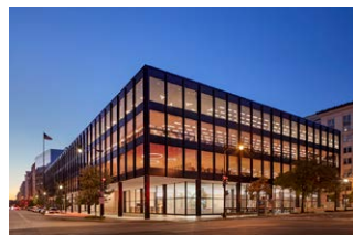
Martin Luther King Jr. Memorial Library, Washington D.C., US