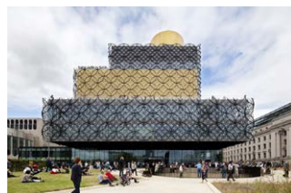
Library of Birmingham, UK