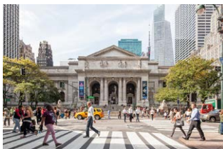
New York Public Library, US