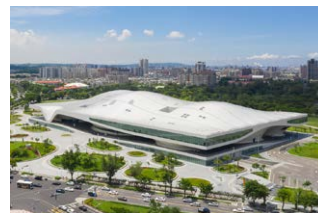
National Kaohsiung Centre for the Arts, Taiwan