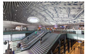
Municipal Offices and Train Station, Delft, NL