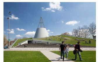
Delft University of Technology Library, NL