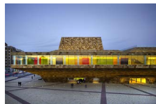
La Llotja Theatre and Conference Centre, Lleida, Spain